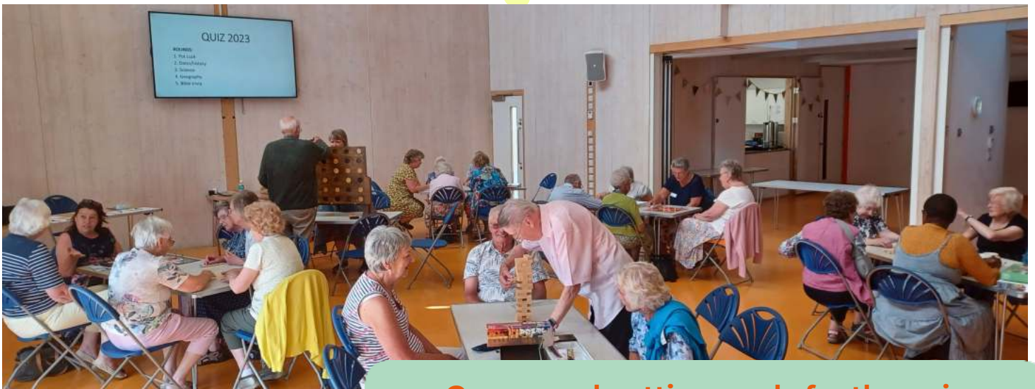
Games and getting ready for the quiz