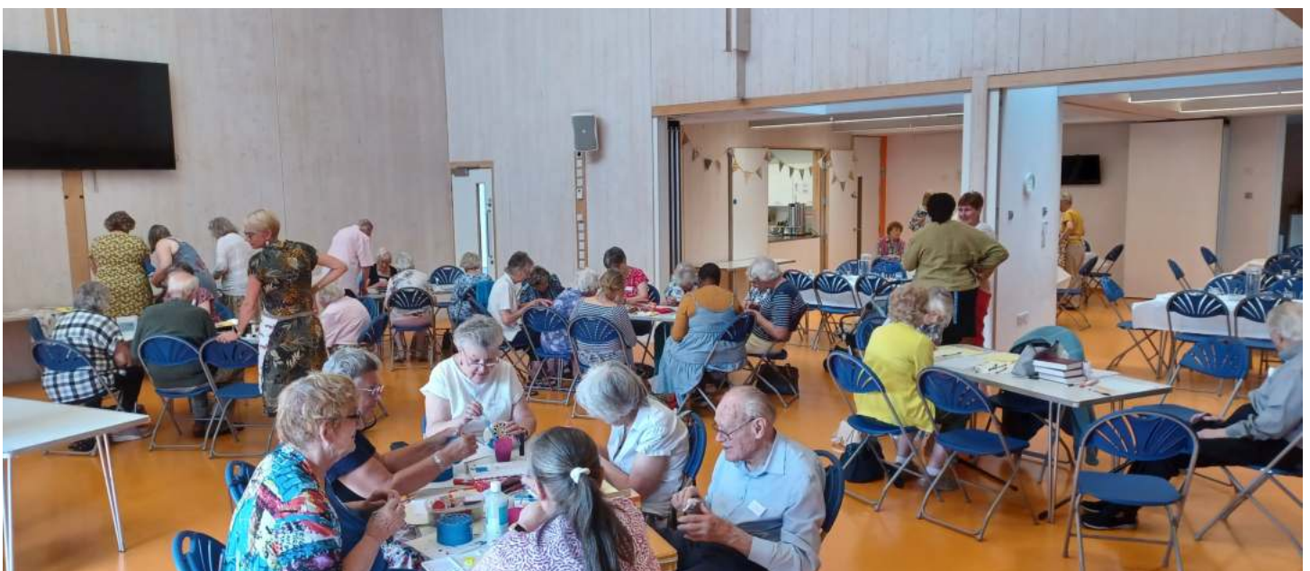
Arts and crafts in the morning