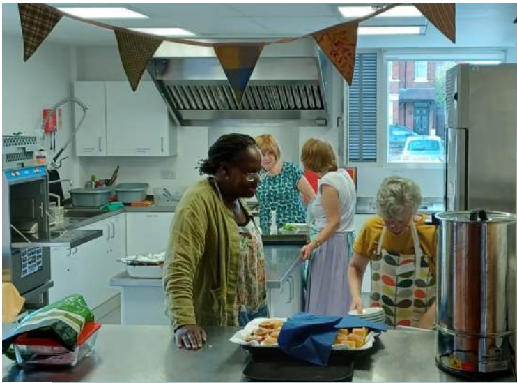
Just some of our expert cooks – Thank you!!